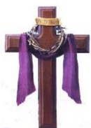
Friday, Stations of the Cross at 7 p.m.

Parish Finances: Offertory: Envelopes £561 Loose Plate £826 Contactless £179 Building Fund; £318 Thank you for your continued support.